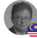
Tan Sri Razali Ismail Chairman Global Movement of Moderates Foundation