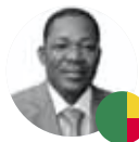
H.E. Pr. Nassirou BAKO ARIFARI President Parliament Committee on International Relations, Defense and Security Former Minister of Foreign Affairs