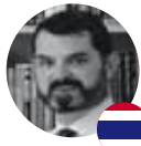
Christopher Ankersen Chief, Security and Safety Section Bangkok | Security Adviser, United Nations Department of Safety and Security